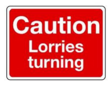
Plate 3-2: Example of Proposed Warning Signage for Public Highway